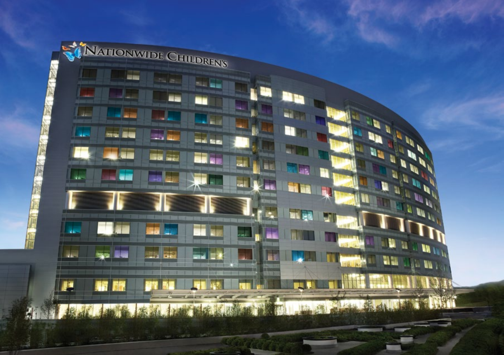
Nationwide Children's Hospital is one of the largest children's hospitals in the nation.