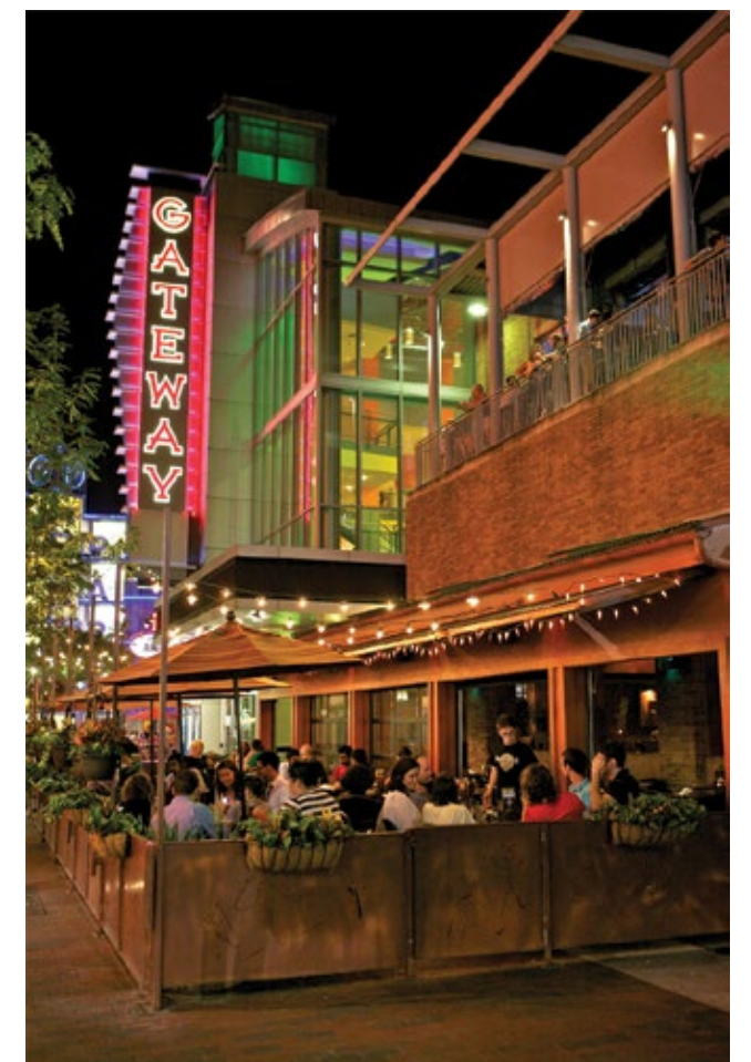
South Campus Gateway