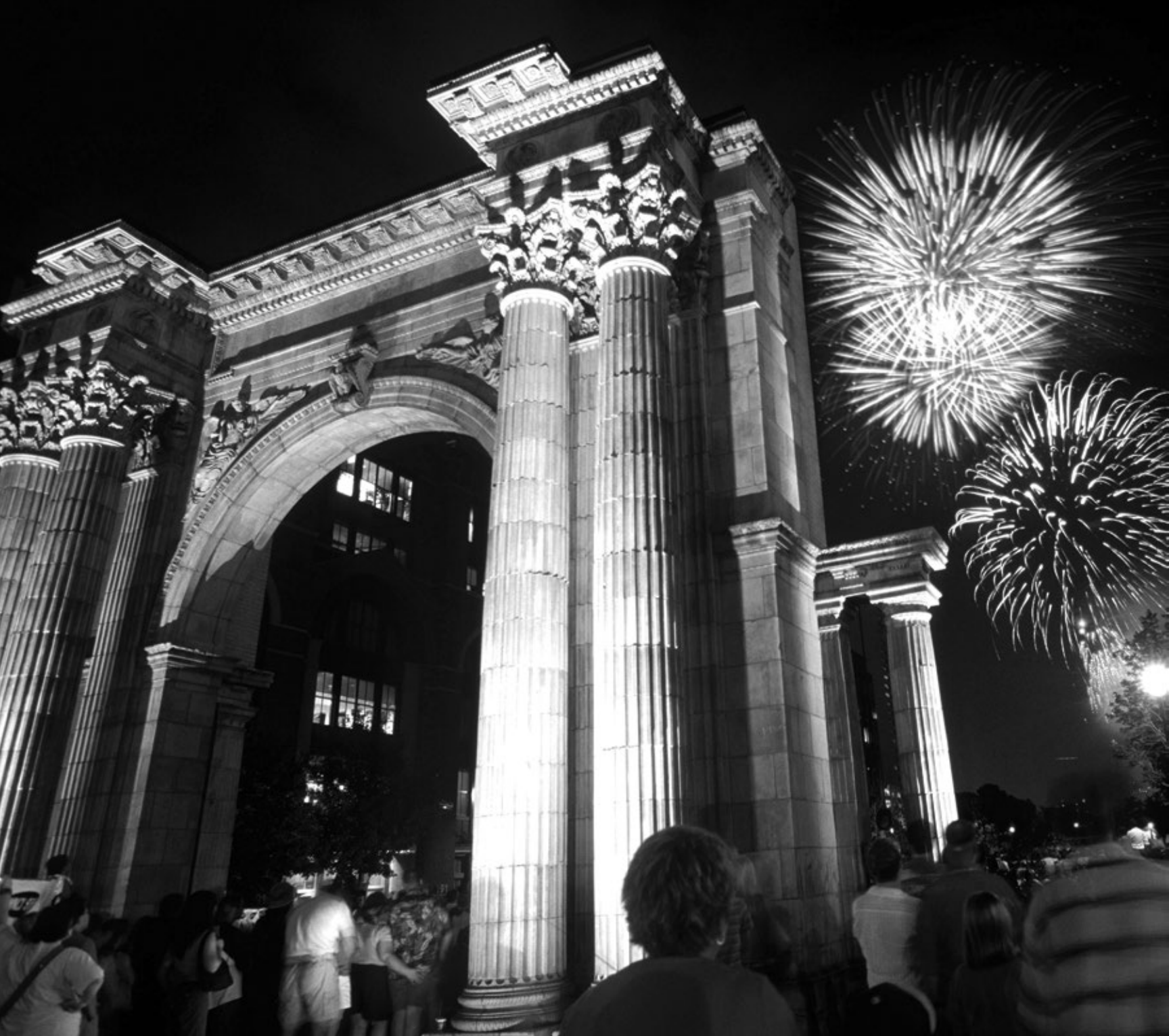
View of Red, White & Boom! from the Arena District

Columbus is among the top 10 U.S. cities for young professionals (age 25-34).