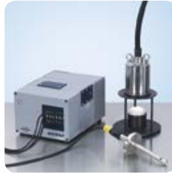
MATRIX-F duplex with fiber optic probe and measurement head.