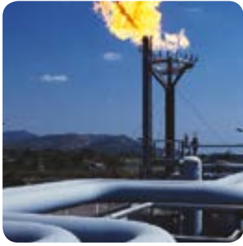
MATRIX-F FT-NIR spectrometer is ideal for in-line and on-line process monitoring.