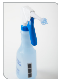
OtoClear® SprayWash Kit