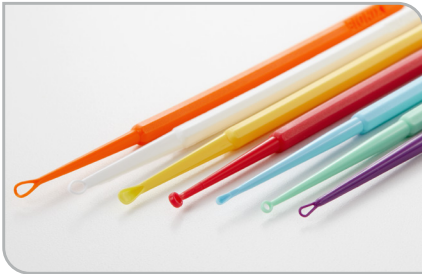
Safe Ear Curettes™