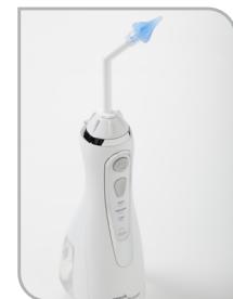
OtoClear® WaterPik® Kit

USE code T-AAP2021 to receive 10% OFF when placing your order | www.bionix.com