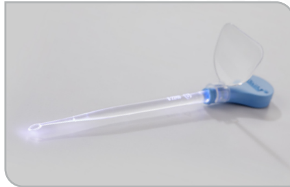
Lighted Ear Curette™