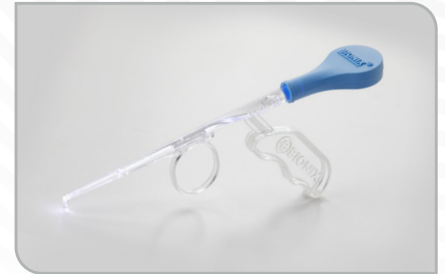
Lighted Articulating Ear Curette