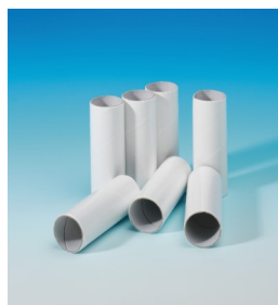
Pediatric Mouthpiece Order #3301 $17/bag of 100