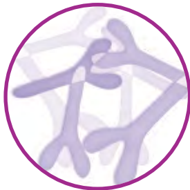
Bifidobacterium breve M-16V

Live microorganisms that, when administered in adequate amounts, confer a health benefit on the host 25