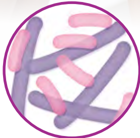
scFOS/lcFOS prebiotic blend §

Prebiotic oligosaccharides can help support normal development of the infant immune system 21,22 and help promote infant digestive health 23,24