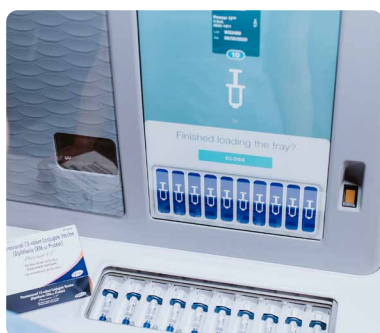
Informative Graphical Interface