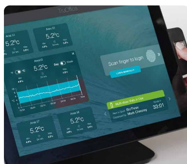
Biometric Secure Access