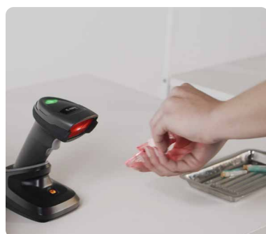
Wireless Barcode Scanning